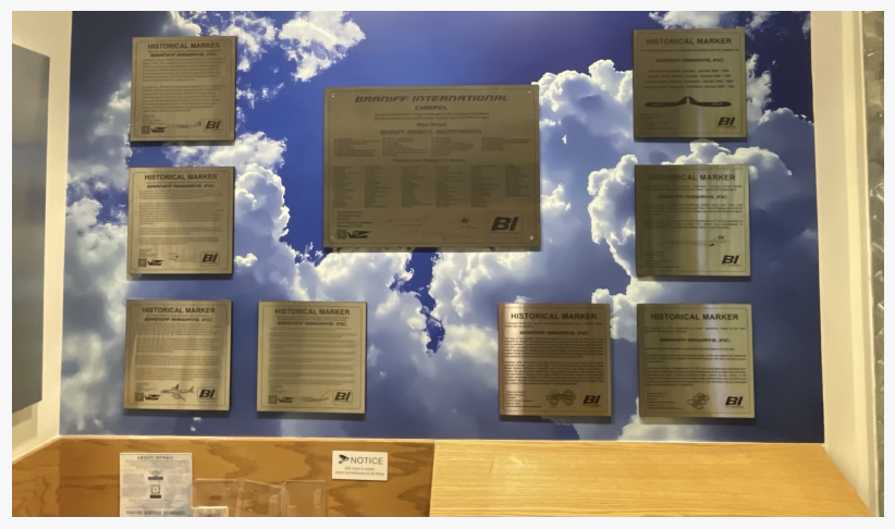
Braniff Airways Foundation dedicated nine new Braniff Trail Historical Plaques at DFW Airport

Love Field's Director of Aviation stated that, "the plaques will bring new awareness to Braniff's unique accomplishments at the airport."