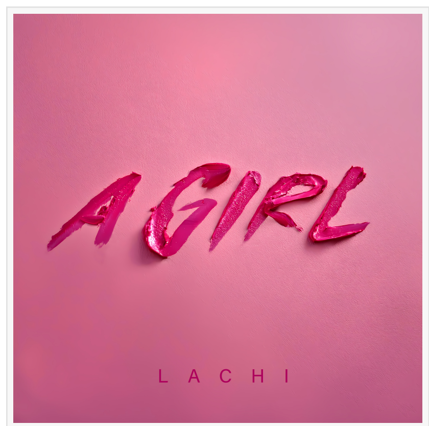
'A Girl' by Lachi Music

The MAD DIFFERENT project debuted in October with the acclaimed release of 'Out of the Dark' and will continue to shine with upcoming releases,