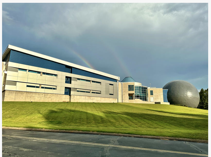
Wonders Center and Science Museum, Dickson, Tennessee

The Wonders Center and Science Museum of Dickson, Tennessee, with over 100,000 square feet, is the largest science museum in Tennessee. The museum also features a full dome planetarium capable of seating 140 persons. Using the newest planetarium video equipment available, visitors can explore the depths of the heavens. Also, within the planetarium are two, five-foot tall Tesla coils capable of generating a combined one-million-volt electrical show that also plays music. This ranks as one of the top planetarium experiences in the world.