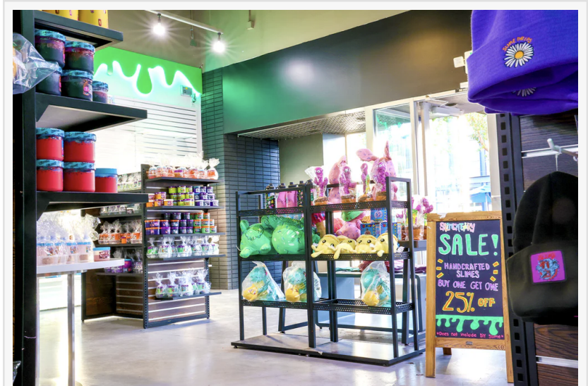
Inside the Slimeatory retail store in Gilbert, Arizona

EINPresswire.com/ -- From YouTube challenges to retail shelves, the Slimeatory store is expanding its reach with the opening of a second location in Los Angeles, California this December. Located at the Brea Mall, the store will be a place for adults and children alike to explore the world of slime. Guests will have the chance to create their own slime concoctions at the one-of-its-kind do-it-yourself slime bar --where customers can choose between a variety of textures, charms, pigments, scents, and more to craft their perfect slime.