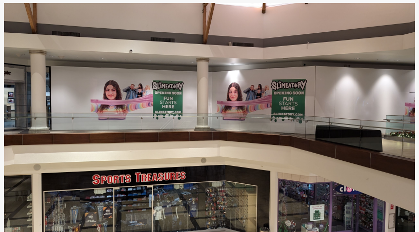
Slimeatory's newest location coming soon to Brea Mall in Los Angeles, California