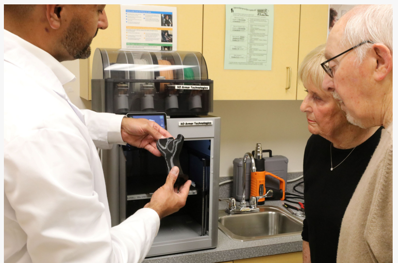
On-site 3D Printing with XO Armor

Using Bambu Lab’s 3D printing technology, XO Armor enables healthcare providers to manufacture high-quality, customized medical devices at the point of care—without reliance on third-party suppliers or expensive external equipment. This rapid on-demand production model minimizes inventory expenses and reduces wait times for patients, enhancing both efficiency and patient outcomes. On-site production also significantly cuts costs, with prices less than half those of conventional DME, further democratizing access to critical healthcare resources.