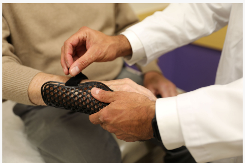
Custom-fit Orthotic Devices

Additive manufacturing is especially impactful for creating custom-fit devices such as orthoses, splints, and other essential support equipment. Patients benefit from perfectly tailored devices that meet their specific needs and anatomical characteristics, while clinicians save time and resources by bypassing traditional casting methods. This shift allows medical professionals to dedicate more time to patient care, boosting overall treatment quality and satisfaction.