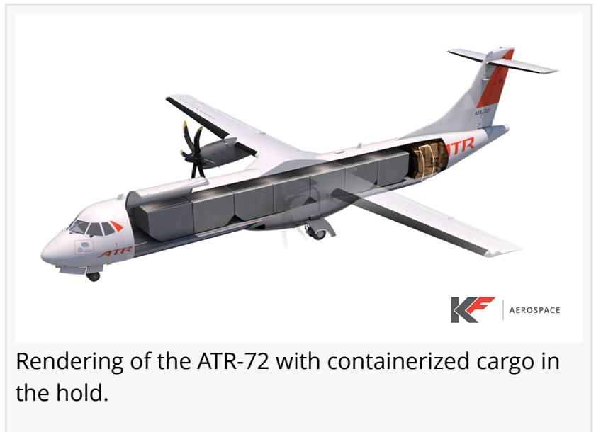
Rendering of the ATR-72 with containerized cargo in the hold.

Aerospace will upgrade the BCFN fleet to the modern ATR72-500F aircraft, helping to ensure continued efficiency and reliability in cargo transportation across the province.