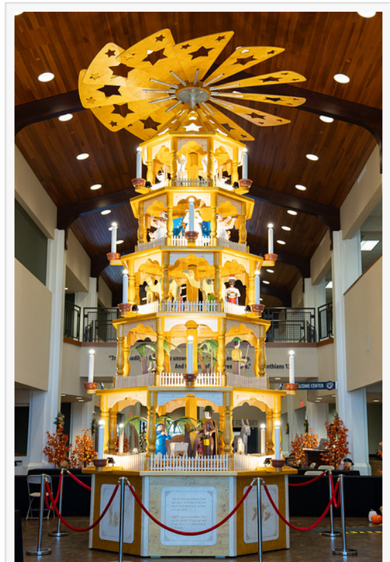
White's Chapel Methodist Church 23-foot indoor Christmas pyramid ground floor view