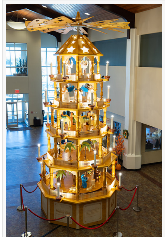
Second floor view of 23-foot five level Christmas pyramid at White's Chapel Methodist Church

Many consider German Christmas pyramids precursors to the modern Christmas tree, and their timeless designs have captivated people worldwide for centuries.