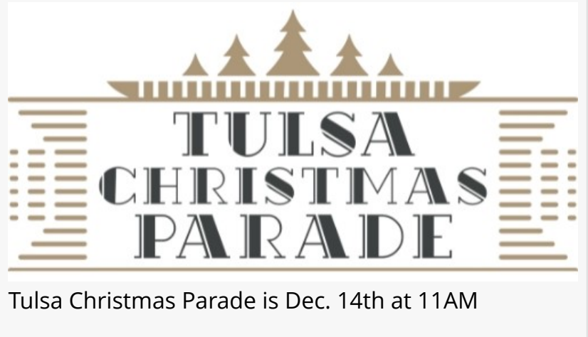
Tulsa Christmas Parade is Dec. 14th at 11AM