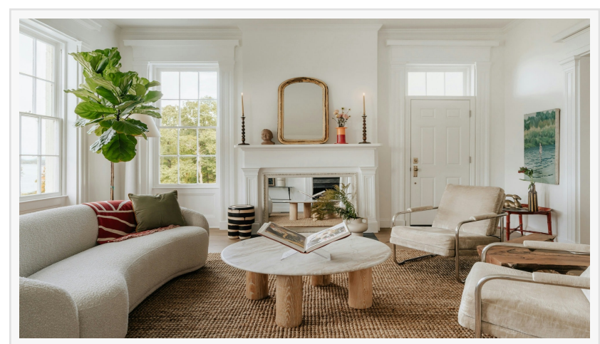
Burbank Upholstery Cleaning | JP Carpet Cleaning Expert Floor Care

With over 20 years of experience in professional cleaning, JP Carpet Cleaning Expert Floor Care brings expertise and attention to detail to every project. The introduction of these services to Burbank reflects the company's commitment to providing tailored solutions that meet the diverse cleaning needs of the local community.