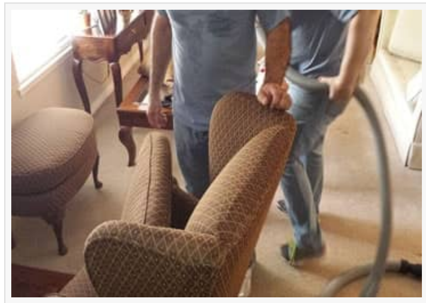
Upholstery Cleaning Wing-Backed Chair

Expanding Services: Meeting a Range of Cleaning Needs In addition to Burbank upholstery cleaning, JP Carpet Cleaning Expert