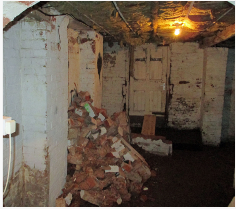
Cellar Conversion Waterproofing

more than just a property maintenance issue; it's a public health concern. Winter is the critical time to address this problem, particularly as more families face the difficult choice between heating their homes and avoiding damp conditions. Awareness and prevention are key to protecting health and property during this challenging season."