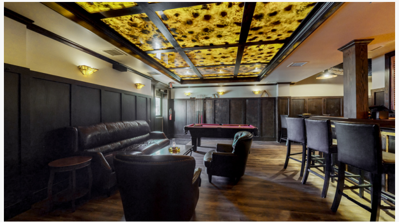
Red Phone Booth Nashville Private Event Space