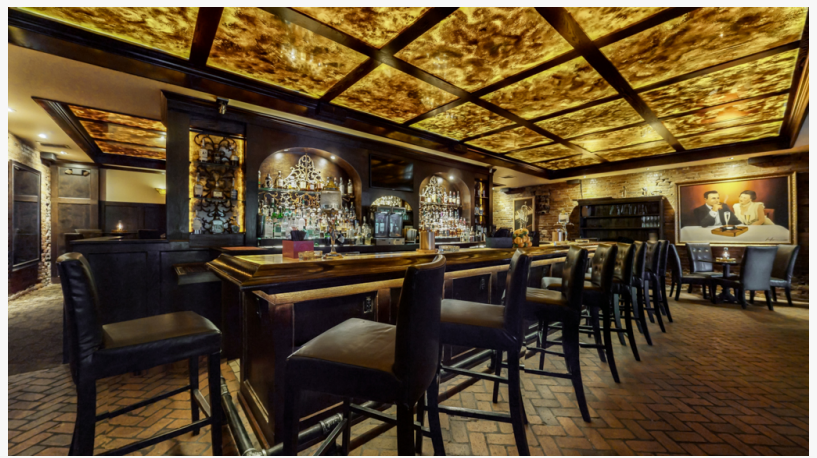
Red Phone Booth Nashville Bar

With its intimate ambiance, handcrafted cocktails, and unparalleled service, Red Phone Booth