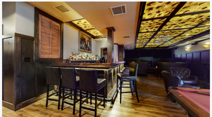
Red Phone Booth Nashville Private Bar