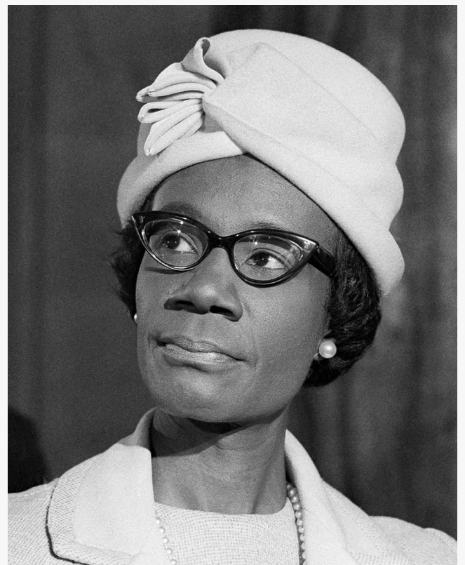
Shirley Chisholm the first ever black woman elected to Congress, and the first woman to pursue a Presidential nomination.