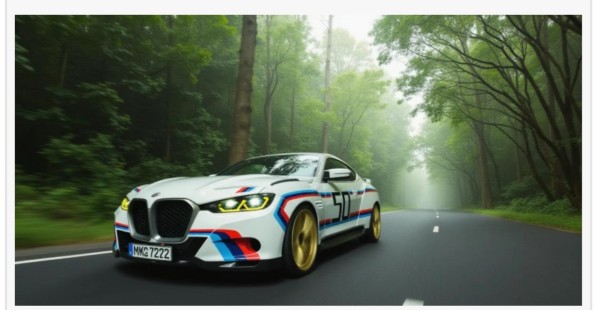
A sleek car image, captured with precision and enhanced through a Flux fine-tuned model for sharpness and clarity.

A luxurious, modern living room with a grand fireplace as the centerpiece. Large windows look out onto a dark, rainy night, where wet tree branches glisten under the night sky. The room is decorated with plush, dark blue sofas and warm amber lighting that