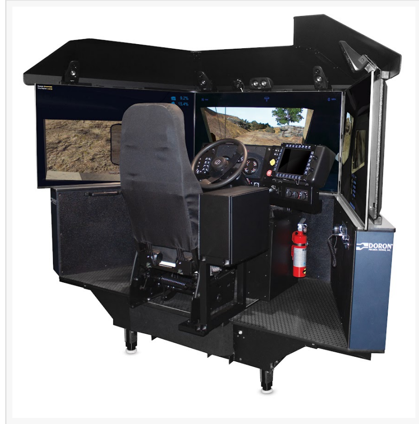
Doron 550JLTVplus 2024

The 550JLTVplus integrates original-equipment-manufacturer instrumentation and controls to replicate the look and performance of the actual vehicle. It offers high resolution graphics, precise vehicle dynamics, and a comprehensive virtual training environment where a driver can experience various weather conditions,