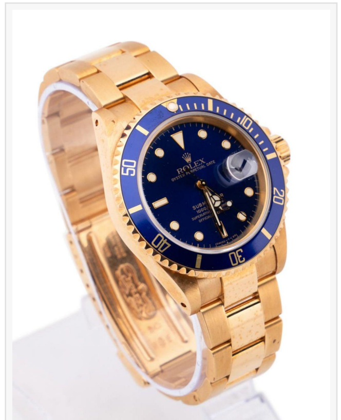
Rolex Oyster Perpetual Submariner date wristwatch in 18k yellow gold, with blue dial, white markers, date window, synthetic sapphire crystal with cyclops window (est. $26,000-$29,000).

An aquamarine pendant in 18k yellow gold with a pear-shaped aquamarine weighing approximately 45.60 carats and ten single-cut diamonds weighing approximately 0.25 total carats (H-J color, VS1-2 clarity), the chain 33 inches long, the total weight 47 grams, has an estimate of $7,000-$9,000.