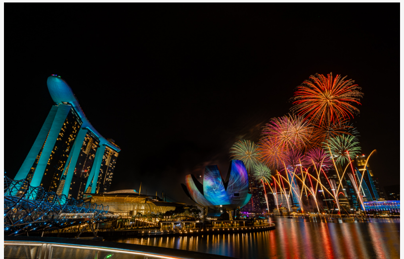
Marina Bay Singapore Countdown

already begun at Marina Bay with illumi — one of the world's largest light and multimedia show that has landed in Singapore for the first time. Visitors can look forward to more exciting activities setting the Bay abuzz in the weeks to come. These include performances by homegrown talents at Esplanade - Theatres on the Bay and a new series of Brightening Lives light projections on The Fullerton Hotel Singapore, featuring artworks by artists with disabilities. As a finale, Marina Bay's spectacular annual fireworks display, designed by the team behind STAR ISLAND, will light up the sky around the Bay on New Year's Eve to bid farewell to 2024.