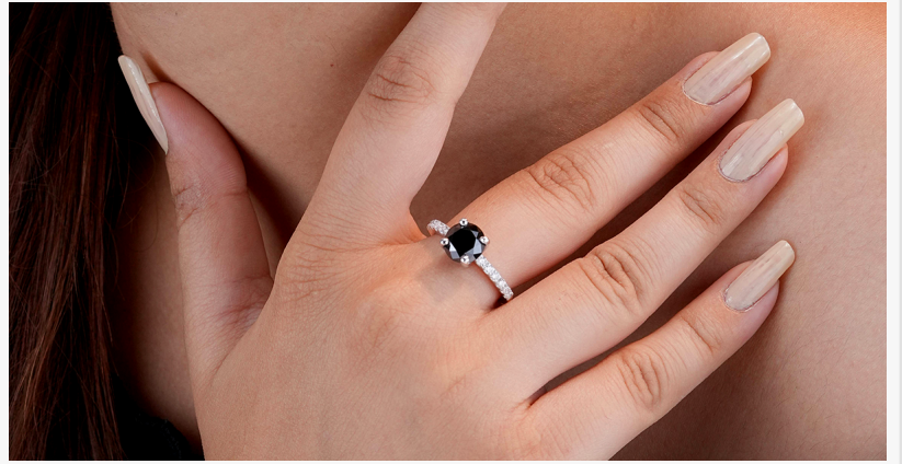
black diamond rings4

To celebrate the launch, Gemone Diamonds is offering a limited-time discount on all black diamond rings. Customers can explore the collection and take advantage of this offer by visiting the official website at Gemonediamond.com