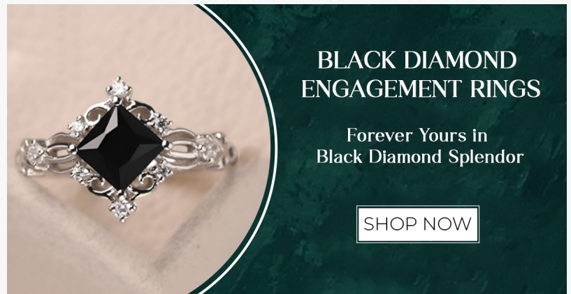
black diamond rings

The Black Diamond Ring Collections offers: