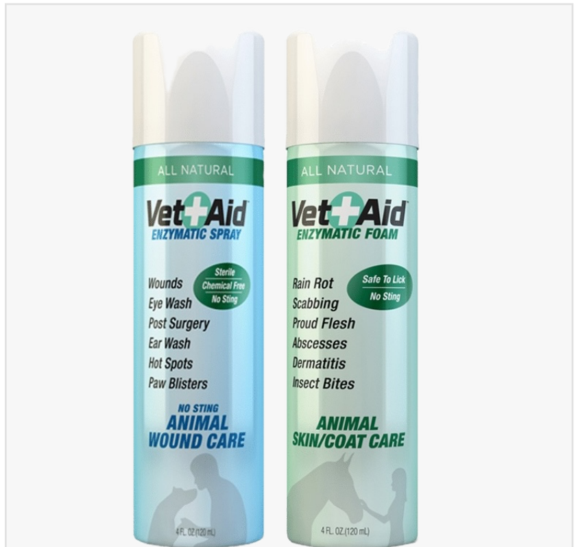
Vet Aid Products: Wound Care Foam and Wound Care Spray

All Vet Aid products are manufactured and packaged exclusively in the United States using the highest quality standards. They meet rigorous FDA, cGMP, and EU compliance requirements and are distributed globally across the United States, Canada, Mexico, Singapore, Australia, and Europe. Packaged in state-of-the-art containers to maintain sterility, Vet Aid ensures that every product reaches veterinarians and pet parents in perfect condition.