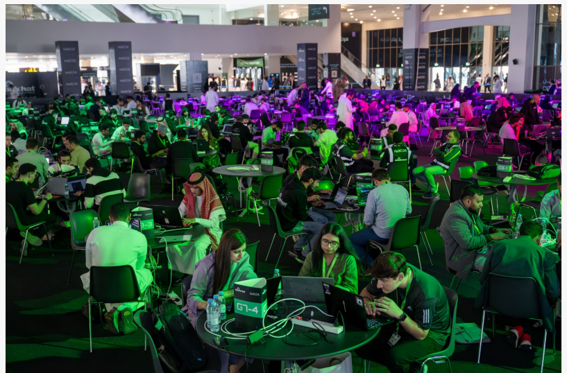
Human Robotics, World Record Hackathons, and Exploration of AI Take Spotlight at Black Hat MEA

"The age of AI is finally here, but what does that mean for cybersecurity?," he asked. "As