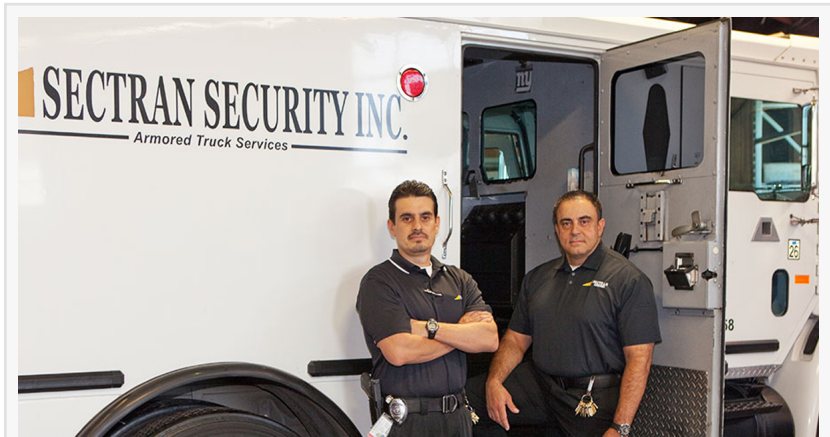
Armored truck security services

The company's services are designed to protect and manage the flow of cash and valuables in an increasingly