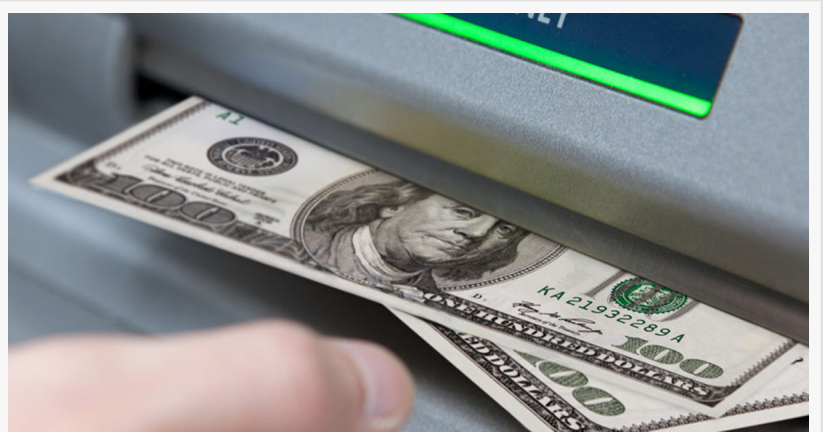
Smart safe cash management services

Smart safes also help clients improve store profitability and loss prevention by tracking deposits and reducing the opportunity for human error. For instance, their smart safe solution enables businesses to manage their cash flow more effectively, providing a reverse ATM experience