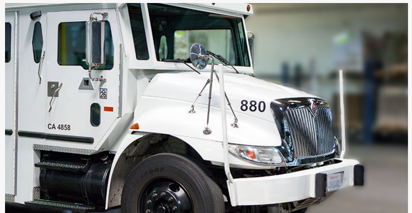
Comprehensive armored truck services