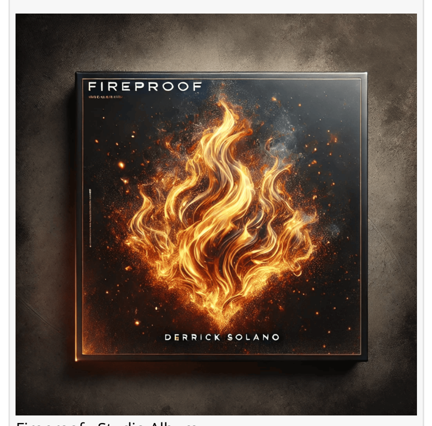
Fireproof - Studio Album

career. It's a powerful reminder that perfection is a myth, and the true path to strength is paved with the messy, raw, and unpolished moments that define us all.