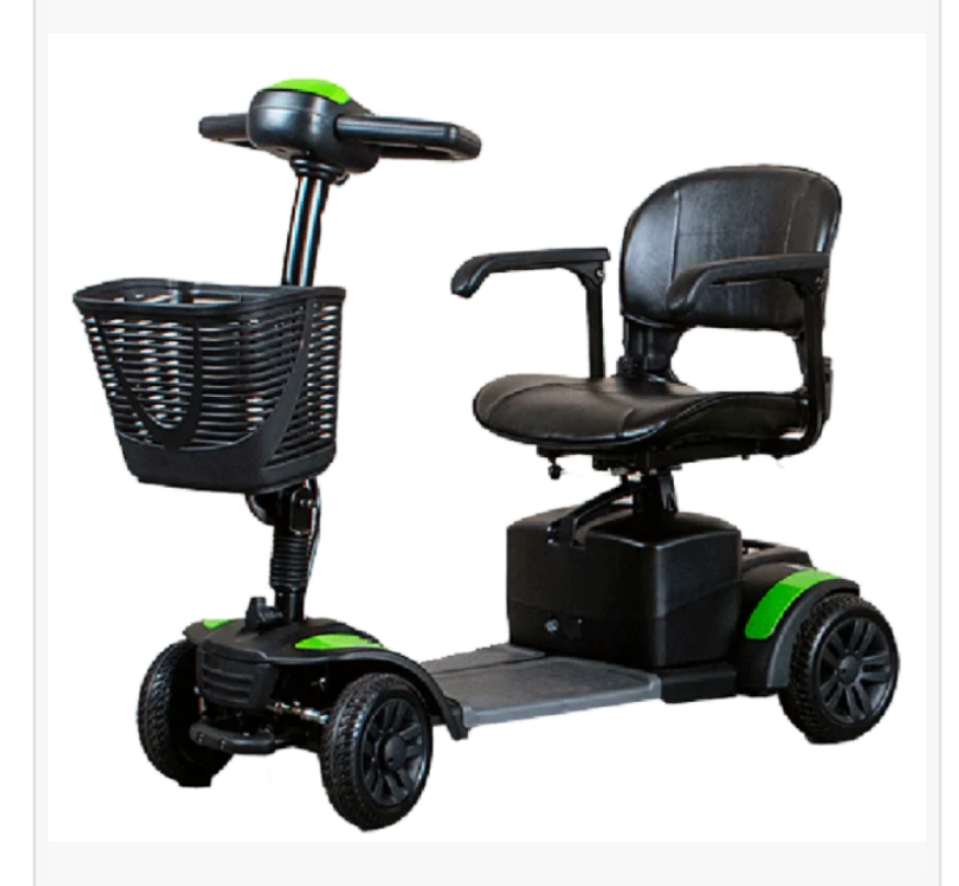
Muai Mobility Scooters

attractions without worrying about getting around. Whether visiting nature parks or attending cultural events, these rental services offer travelers the freedom to fully enjoy Maui.