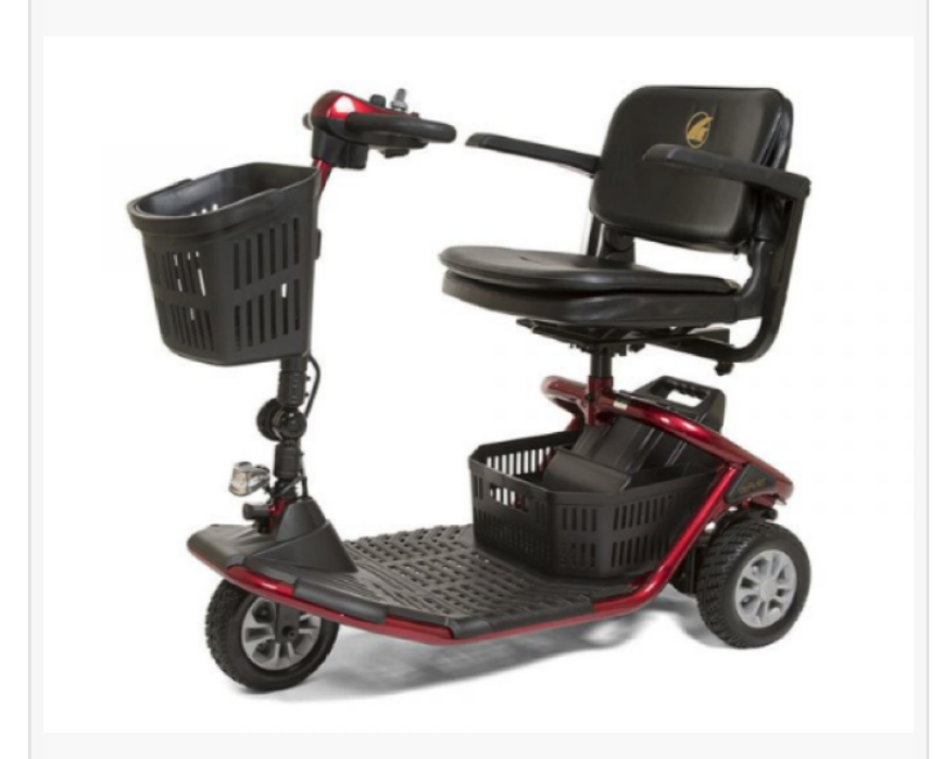
Mobility Scooter Rentals

With these mobility aids, people with special needs can enjoy Maui's beaches, resorts, and top tourist