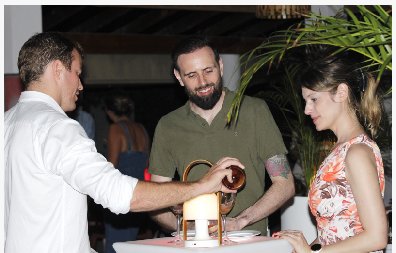
Guests enjoying the wine tasting