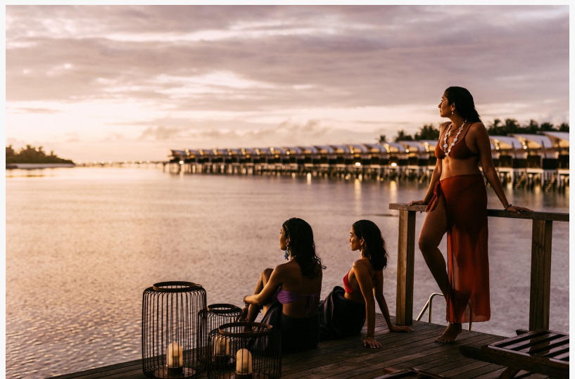
Cinnamon Hakuraa Huraa Maldives