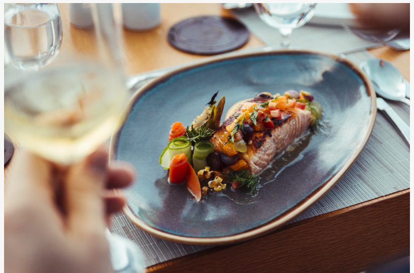
Delectable seafood offerings paired with fine wine