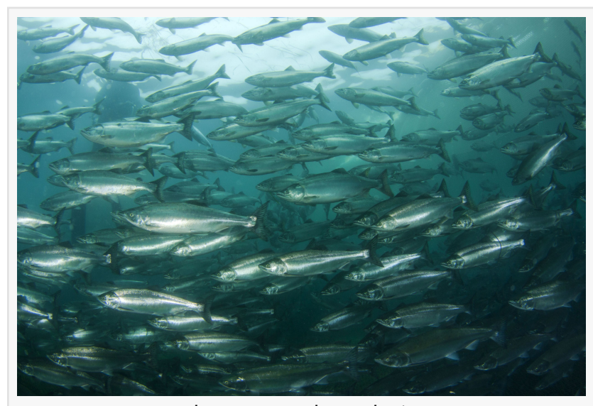
GCAW new member, Nomad Foods, is Europe's leading frozen food manufacturing company with wild caught fish a major part of its business.

Minerva Foods and Nomad Foods join existing members Aramark, Compass Group, Elior Group, Ikea, Kroger, Maple