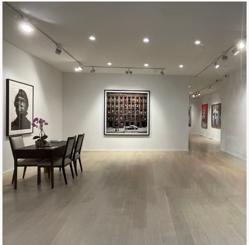
Contessa Gallery | Southampton, NY

Join Us at Art Miami BOOTHS 540 | 541 | 542