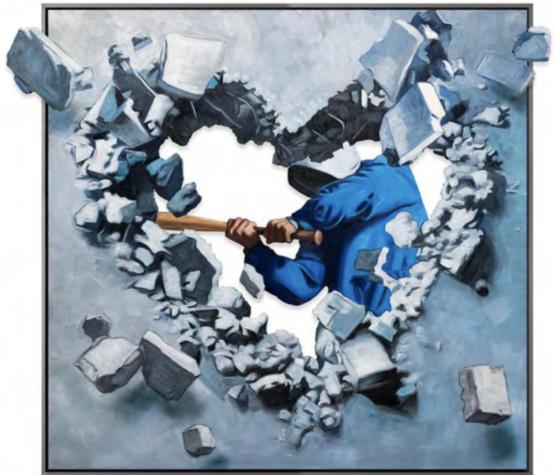
Contessa Gallery - Hijack "Heart Of Stone, 2024"

This press release can be viewed online at: https://www.einpresswire.com/article/764684380