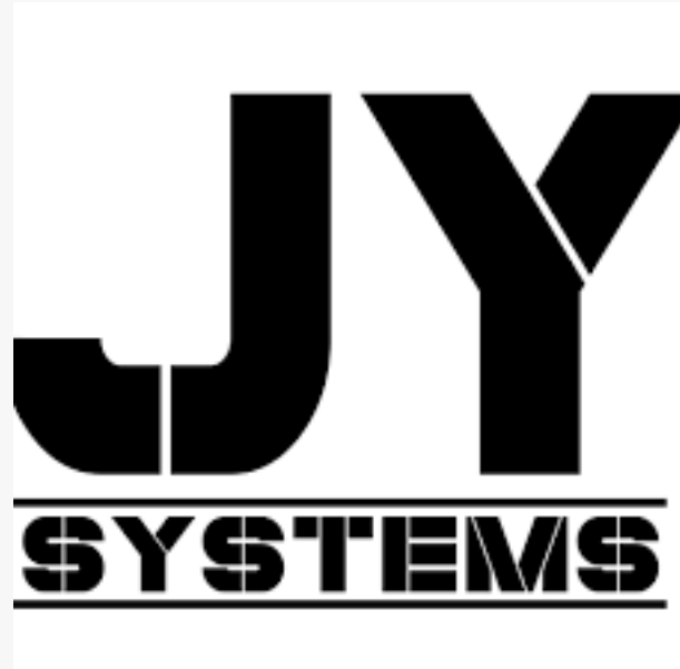
JY Systems Logo

Acquiring JY Systems expands Markon's expertise in systems, software, and cyber engineering, particularly in support of SIGINT and cyber security missions.