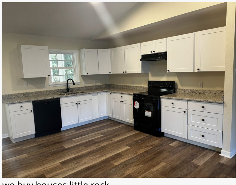
we buy houses little rock

have positively impacted neighborhoods across Little Rock by turning distressed properties into valuable community assets.