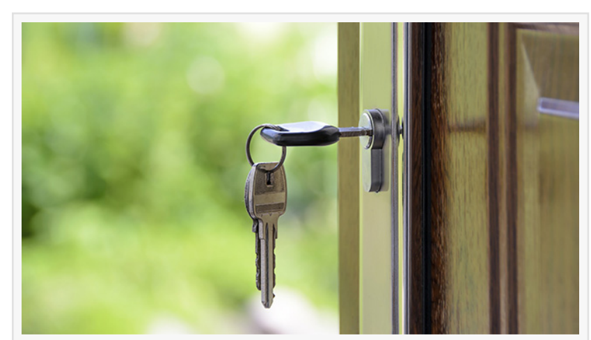
sell house fast little rock ar

Fast Cash Solutions for Homeowners Facing Unique Selling Challenges Mid South Best Offers specializes in purchasing homes directly from owners who face unique selling challenges, such as financial strain, necessary repairs, or issues in the