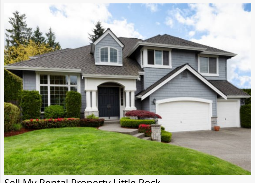
Sell My Rental Property Little Rock