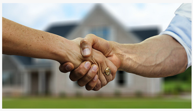
Sell My House Fast Little Rock

traditional sales process. By aiming to buy your house fast for cash, the company provides an efficient selling option that bypasses common delays and complexities of conventional real estate transactions, enabling homeowners to close deals significantly faster than through listing agents.