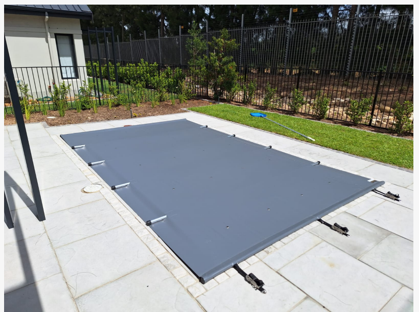
DPC child & pet safety Cover

Understanding that a pool cover is not just a safety feature but also an integral part of a home's outdoor aesthetics, Designer Pool Covers has introduced a line of designer solid covers. These covers are crafted to complement various architectural styles and landscape designs, ensuring that pools remain visually appealing even when not in use