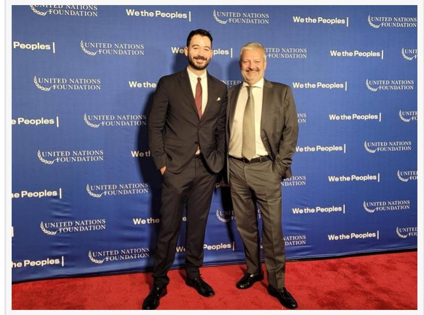
EBC representatives join global leaders at the We The Peoples Gala, reinforcing their commitment to transformative partnerships and equity-focused initiatives.

Global leaders and changemakers unite on stage at the UN Foundation's We The Peoples Gala, celebrating collective progress towards a fairer, more sustainable world.