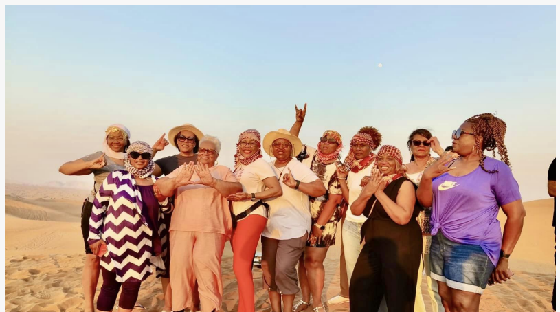
Culture Holidays' Dubai Trip