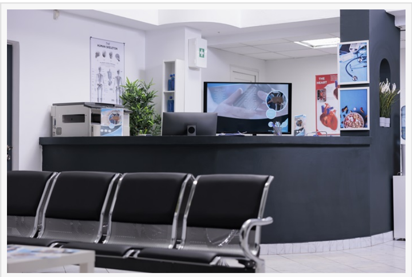
A modern hotel reception with a chic lobby and well-designed service areas, offering a warm and sophisticated first impression for guests.

Euphoria Interiors incorporates biophilic elements, including natural light, plants, and organic material, ensuring neurodiverse environments are nature-positive. Such elements in an environment decrease stress levels, increase the ability to focus, and elevate mental well-being.