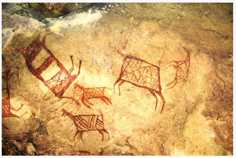
Animals painted with red ochre, believed to hold cultural or ritualistic meanings for early civilizations.

Among many important rock sites in India, Daraki Chattan and Chaturbhujnath nala in central India are of great significance and have been investigated thoroughly. Out of the 43 excavated rock sites in India, the