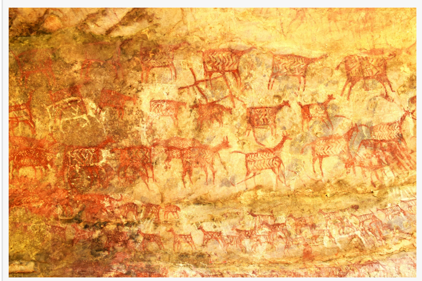
Animals, both wild and domesticated, illustrated in remarkable detail, reflecting the deep connection early humans had with their environment.

male and female—offering a rare glimpse into the artistic expressions of early human communities. Likhi Chhaj serves as a testament to the enduring cultural traditions of prehistoric societies in the region.