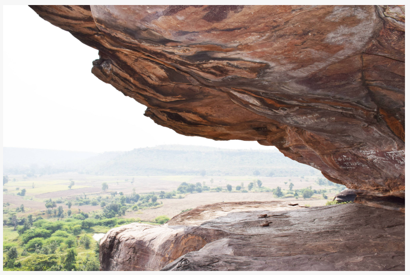
The Mesolithic rock shelters of Madhya Pradesh

The preservation of these rock shelters and cave temples is crucial for maintaining a tangible connection to