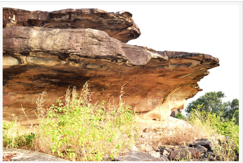
Ramchhajja Group of Rock Shelters

Located near the dense forests of Paharganj in Jaura Tehsil, the Likhi Chhaj rock shelters are among the most notable sites. This area features a series of natural rock shelters spanning approximately 2 km, adorned with prehistoric paintings. These artworks depict scenes of hunting, geometric patterns, and human figures—both