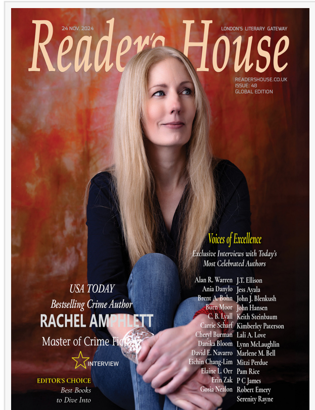
Reader's House latest issue (48)