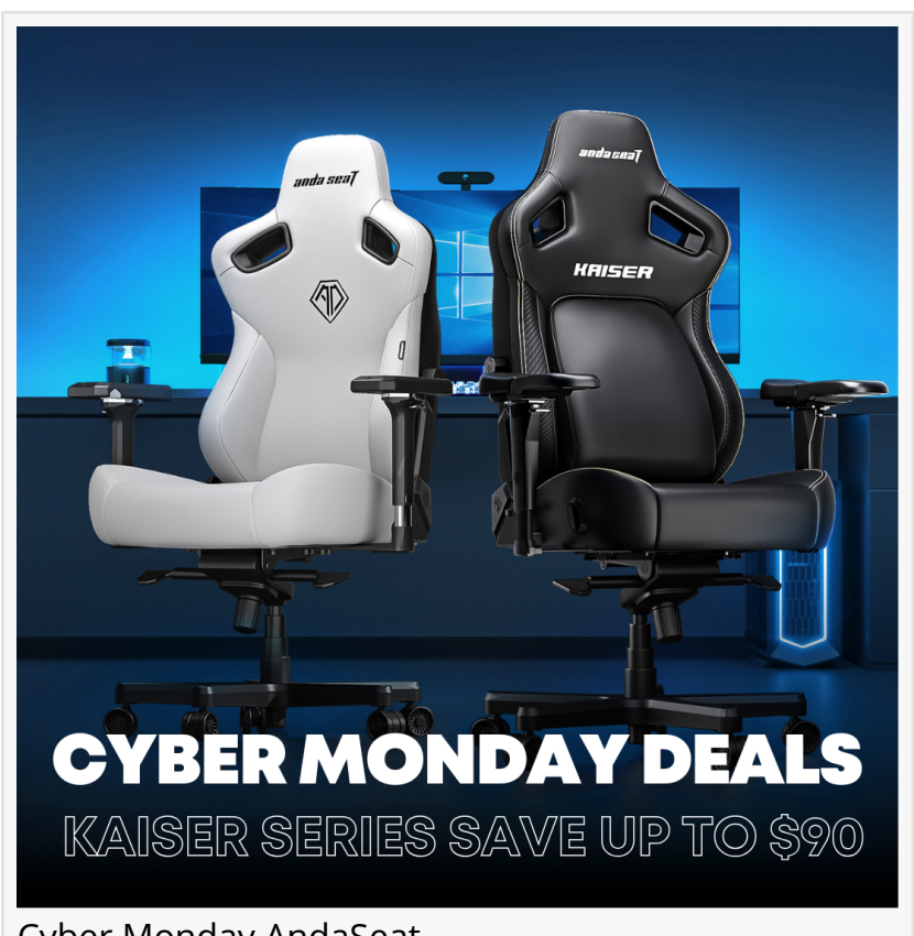
Cyber Monday AndaSeat

SPOKANE, WA, UNITED STATES, December 2, 2024 /EINPresswire.com/ -- AndaSeat, a recognized name in the field of ergonomic and gaming chairs, has announced its Cyber Monday Week, taking place from December 2 to December 9, 2024. This event highlights the brand's commitment to creating innovative seating solutions that address modern ergonomic needs while offering temporary price reductions to mark the occasion. This announcement reflects AndaSeat's broader dedication to enhancing productivity, comfort, and long-term well-being through advanced chair design.