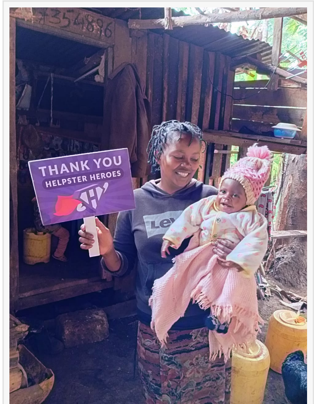
A Kenyan mother and her 7-month-old child saved from acute kidney injury, severe malnutrition and pneumonia

Helpster Charity US Inc, founded by a team of heart-driven IT specialists, is a non-governmental organisation that operates as both offline infrastructure and a mobile application, providing a platform for fundraising to support the treatment of needy children living in remote regions through an impactful, transparent and efficient system. The Charity, now made up of doctors and other professionals, is committed to ensuring no child suffers or dies due to lack of financial