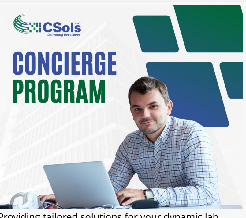
Providing tailored solutions for your dynamic lab informatics landscape

<u>CSols Inc. is recognized</u> as the premier lab informatics solutions provider in North America. We have earned and maintained a reputation for excellence in everything we do over more than two decades. Our team of informatics, domain, regulatory, data, and IT experts has evolved beyond the lab to provide informatics expertise to forward-thinking organizations in life sciences and other industries. As a truly independent firm, we provide objective guidance and tailored solutions through our holistic services of developing informatics and data strategy and implementing, integrating,