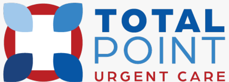
Total Point Urgent Care Logo