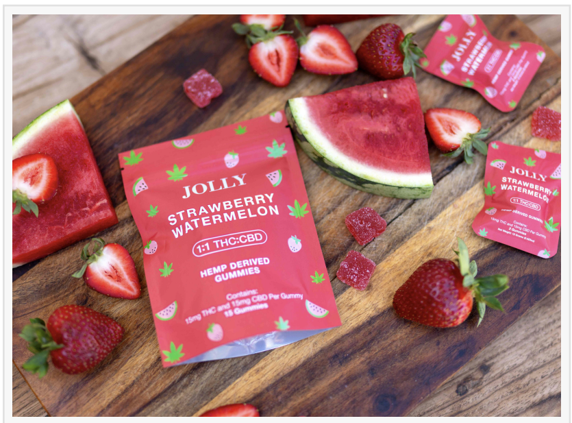
Strawberry Watermelon Jolly 1:1 CBD to THC gummies

Jolly Cannabis is dedicated to producing high-quality cannabis products that bring joy and wellness to consumers. With a commitment to all