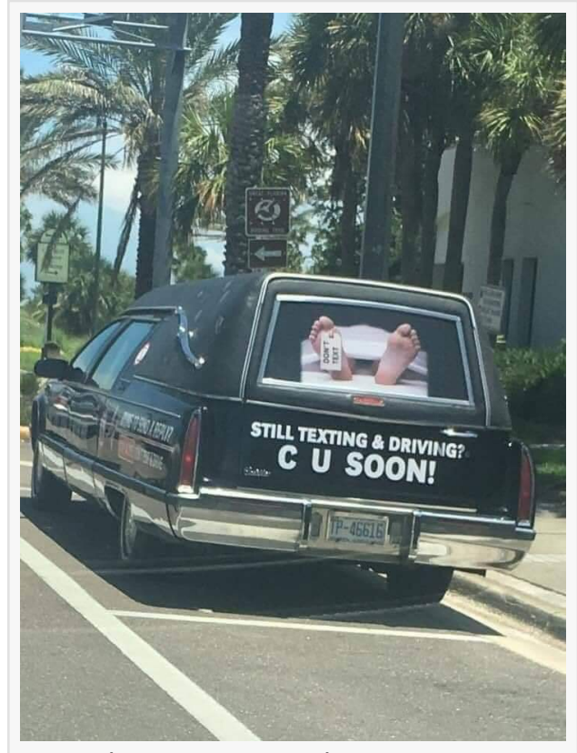
I can't be DEAD, I'm only 17!