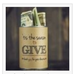
It feels good to support an allvolunteer cause.

This press release can be viewed online at: https://www.einpresswire.com/article/765560324