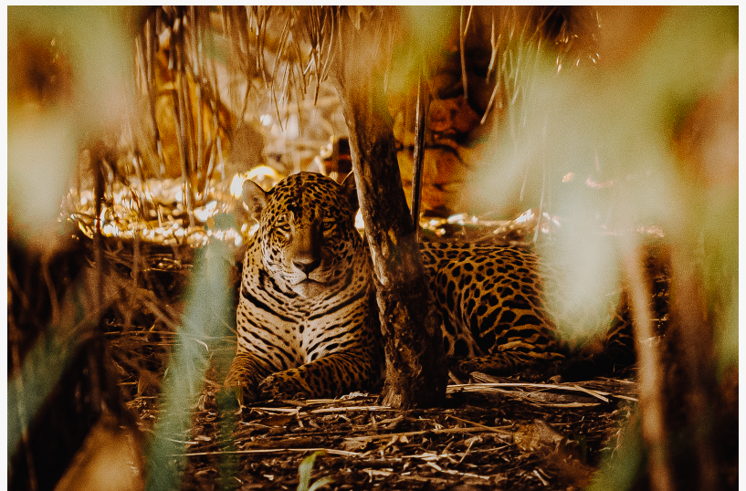
A jaguar rests in the shade at Pantanal Matogrossense, the world’s best destination for spotting this iconic predator in the wild.