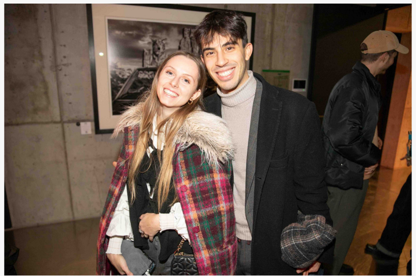
Italian shortlisted attendees at Berlin fashion Film Festival

5. Best Script / Storytelling: "Eternity" by Bamba Kimball, with ArtCenter College of Design, for Calvin Klein (USA)