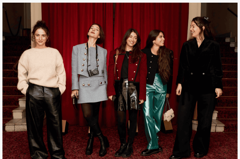
Georgia-based Bfff shortlisted Advan Production