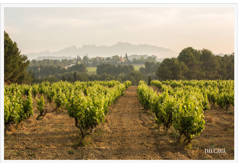
D.O. Cava Vineyards

VILAFRANCA DEL PENEDÈS, SPAIN, December 3, 2024 /EINPresswire.com/ -- Protected Denomination of Origin Cava, one of Spain's premier sparkling wine regions, is setting a new global standard by committing to 100% organic production for every bottle of Cava de Guarda Superior—including Reserva, Gran Reserva, and the prestigious Cava de Paraje Calificado by 2025. This bold step not only