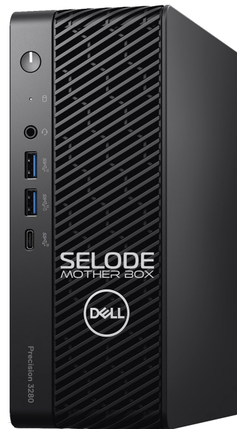
The Selode Mother Box is the world's first compact and offline AI device designed for business

The SELODE Mother Box addresses some of the most significant and current challenges SMEs face in adopting AI: