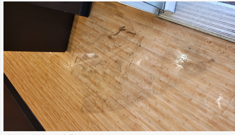
cleaning wood floors

Deep Cleaning: Advanced tools extract contaminants lodged within the wood grain.