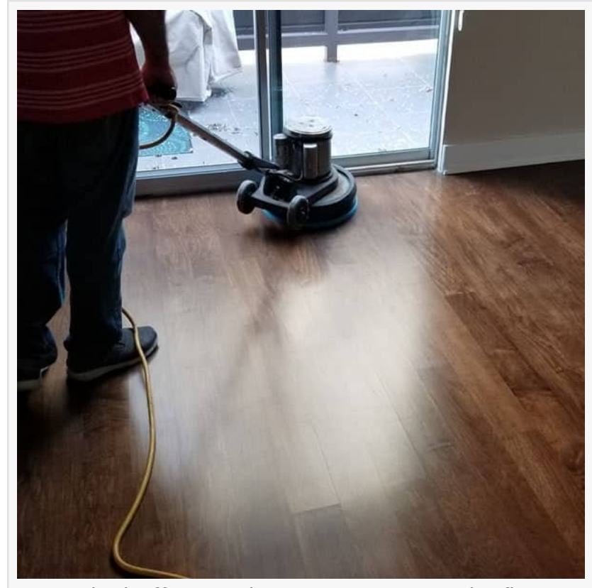
Using the buffing machine to reinvigorate the floors shine

Customer Dedication JP Carpet Cleaning Expert Floor Care is renowned for its dedication to customer satisfaction. Feedback