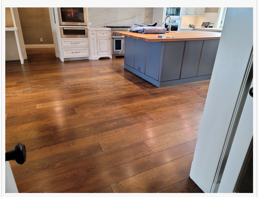
Eco-friendly wood floor cleaning products

consistently highlights the meticulous care and attention provided during each service. Their use of eco-friendly methods aligns with a commitment to sustainability, ensuring homes and businesses benefit from a healthier environment.