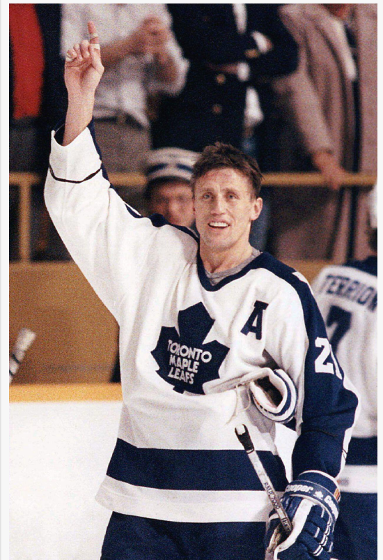
Börje Salming in Toronto Maple Leafs jersey

In addition to his accomplishments on the ice, Salming explores his role as a pioneer for