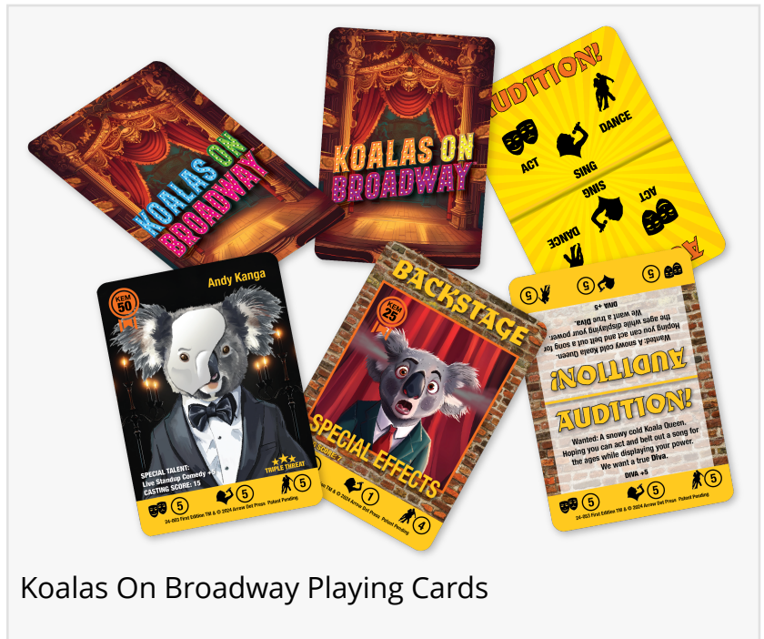
Koalas On Broadway Playing Cards