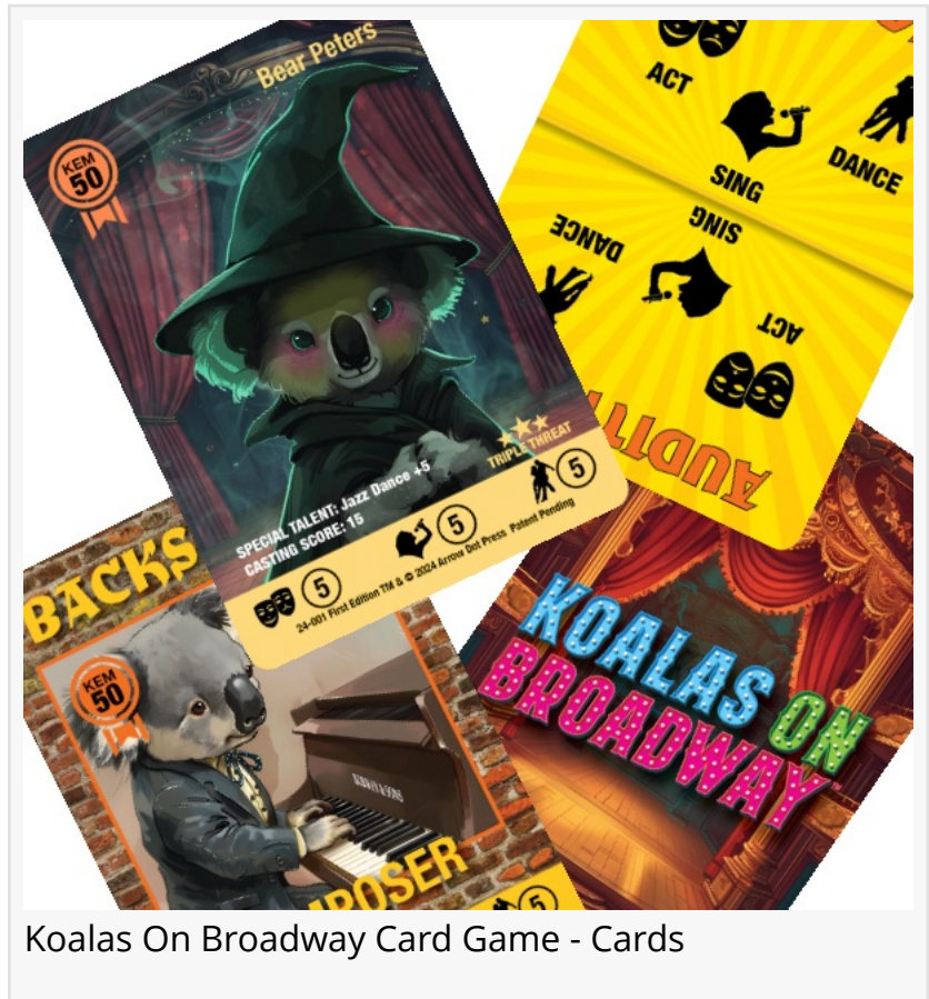
Koalas On Broadway Card Game - Cards

Now over 200% funded on Kickstarter , the game has ignited interest among theater fans and gaming enthusiasts, offering a new avenue to introduce Broadway to wider audiences and create renewed excitement for the industry.