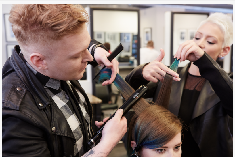
Hair, skin and nail services offered by students under supervision of licensed instructors.