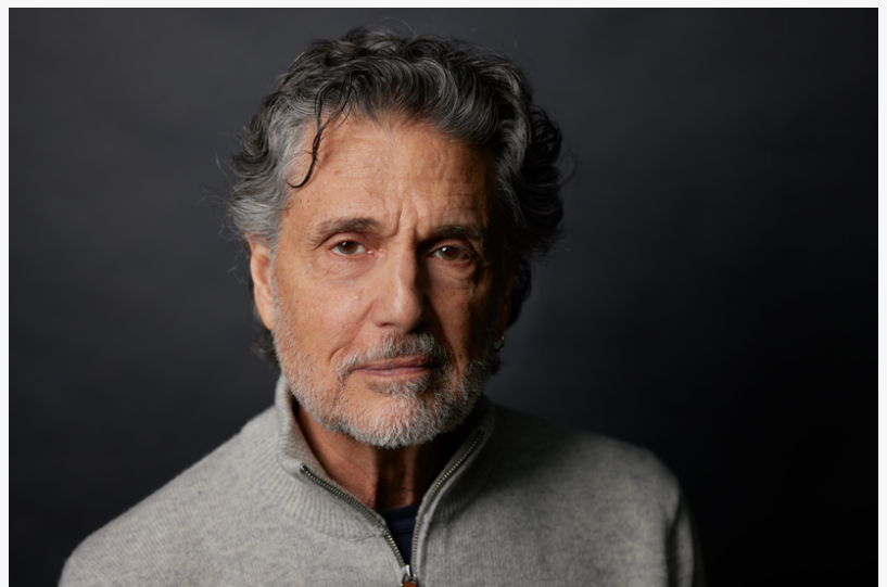
Chris Sarandon

FAIRFIELD, CT, UNITED STATES, December 4, 2024 /EINPresswire.com/ -- Academy Award-nominated actor Chris Sarandon will host acclaimed actor, director, and writer Griffin Dunne for a special live recording of his hit podcast 'Cooking By Heart.' The event will take place Thursday, February 13, 2025, at 7:30 PM at the Sacred Heart University Community Theatre in Fairfield, CT.