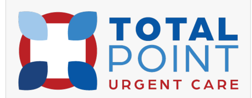
Total Point Urgent Care in Nixa Missouri Logo

<u>In addition to in-person services</u>, Total Point Urgent Care is introducing its TeleVisit program, a virtual healthcare