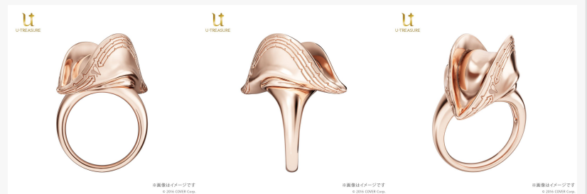
Pirate Hat Ring